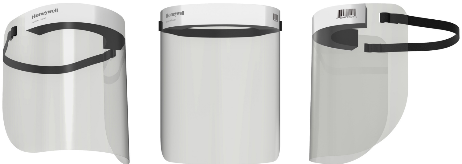
Honeywell Disposable Face Shield - SKU: FF0721

The disposable face shield offers enhanced protection against the transmission of droplets in the air. Unlike DIY solutions, this face shield provides an anti-fog coating to reduce moisture build-up and avoid low visibility and hazing.