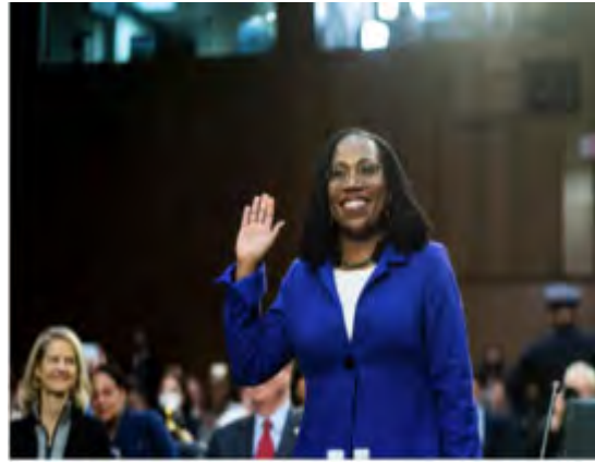
Supreme Court nominee Ketanji Brown Jackson is sworn in for her confirmation hearing on March 21.

The Honorable Ketanji Brown Jackson was sworn in as the 116th Supreme Court justice in June. Her confirmation and swearing in marked a historic moment for the Supreme Court as Justice Jackson is the first Black woman to serve on the court. She has extensive experience serving as a federal trial court judge and a public defender. She replaced Justice Stephen Breyer whom she clerked for after law school.