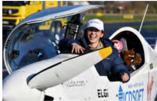
Zara Rutherford gets out of the cockpit after landing her Shark micro-light plane at Fovv Hatzbrig, Belgium, Wapet 11 January.

At 19 years old, Zara Rutherford set two records: